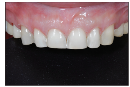
Figure 12. Ortho-facilitated, minimally invasive, enamel-based tooth preparation.