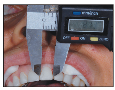
Figure 6. The calipers, measuring the adjusted width and depth.