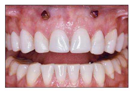
Figure 9. Temporary anchoring devices (TADs) were used to intrude the teeth to align gingival margins.

placed intraorally for aesthetic evaluation (shape, color, and length) and approval by the patient. All 8 maxillary restorations were silanated (BIS-SILANE [BISCO Dental Products]), and the teeth were bonded (ALL-BOND UNIVERSAL) and luted into place using a light-cured resin cement (Variolink Esthetic LC [Ivo-