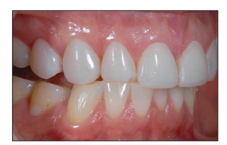
Figure 3. The canines do not protect the front teeth in lateral excursion.