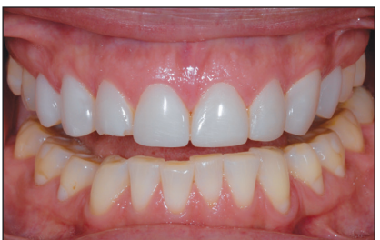
Figure 2. Note the uneven mandibular occlusal plane with crowding, incisal wear, and recession.