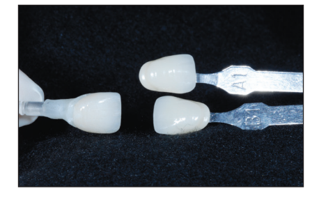
Figure 14. When the porcelain case arrived in the office for delivery, a color verification process was carried out by placing the veneer on the composite dye (custom tab on the left) and checking the color against the shade tabs.