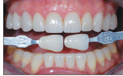
Figure 15. A1 and B1 shade tabs were used to evaluate the existing final color.