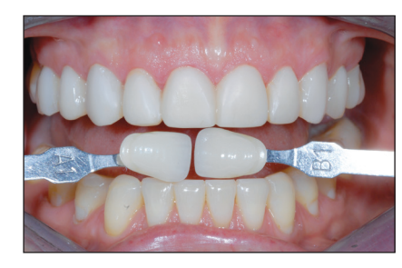
Figure 13. Photographs of bis-acryl (Luxatemp [DMG America]) prototypes with shade tabs used to aid in selecting the final color.