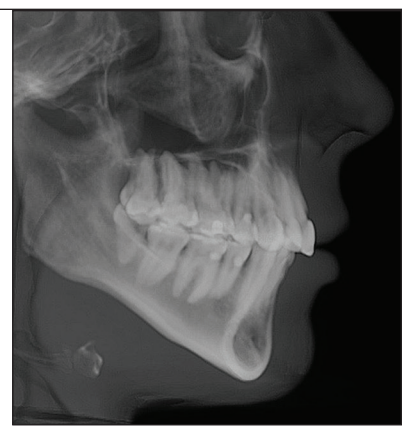
Figure 4. In this lateral cephalometric view, note that the central incisal edge position is tucked under the lip.

and left untouched because the teeth still required intrusion and the aligning of the gingival zeniths of teeth Nos. 6 to 11 (Figure 6).